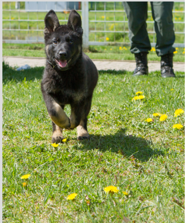
Newly donated pup to be trained for border control and contribute to gene pool in Georgia (May 2017).