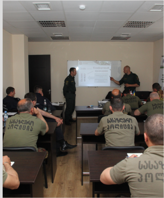
Workshop on the methodology for selection, training and use of service dogs for dog handlers in Georgia (May 2017).