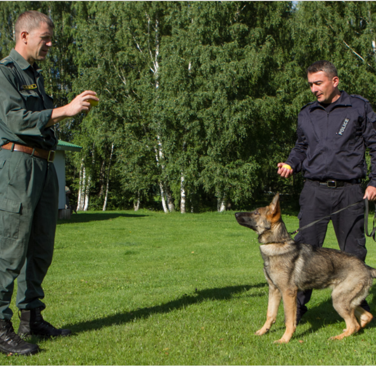
Dog handling training for border guard instructors from the Republic of Moldova and Georgia (Latvia August 2017).