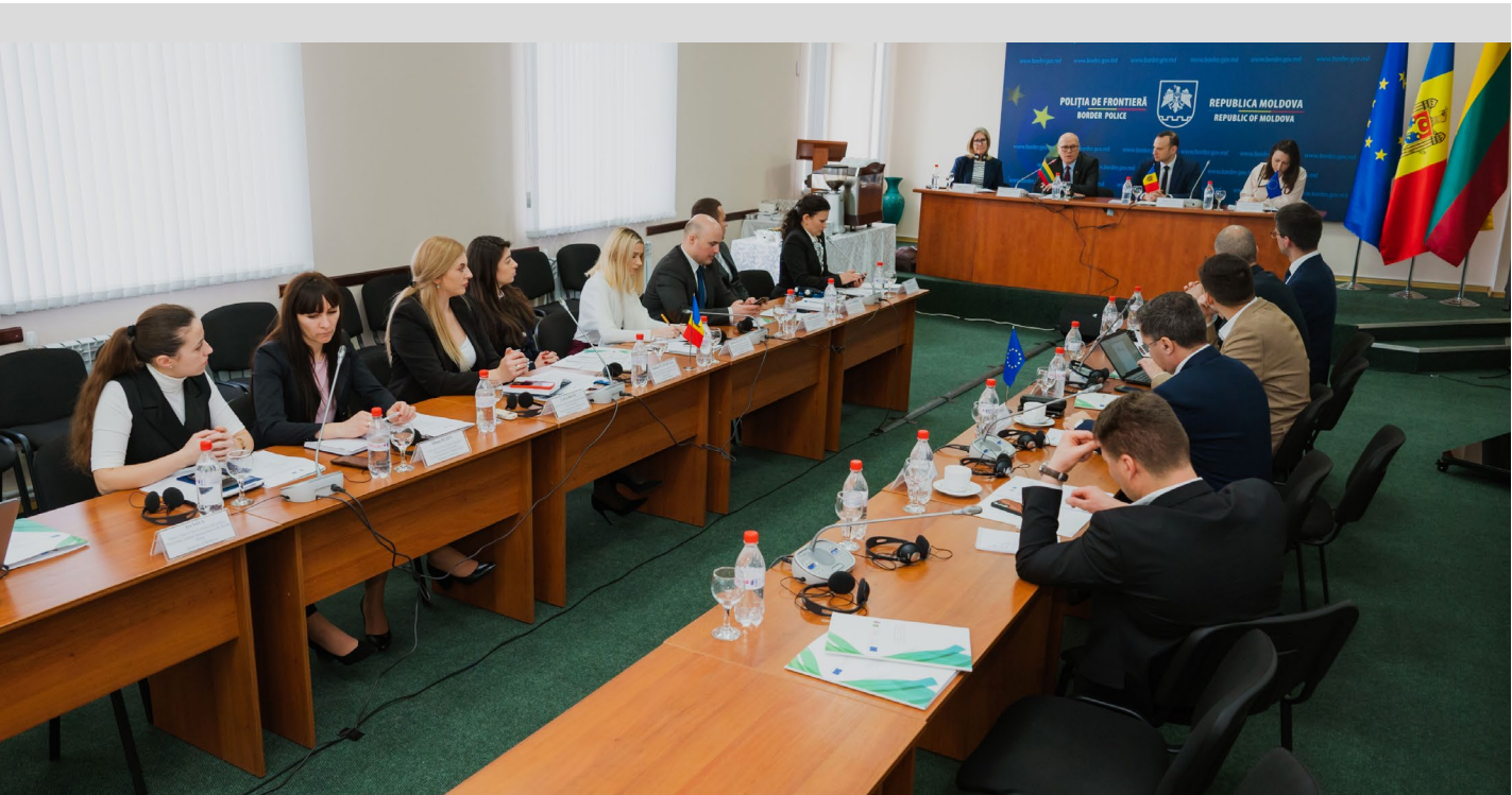
Project final event, 14 February 2024, Chisinau, Republic of Moldova

Specialists from the State Border Guard Service of Lithuania developed a set of guidelines on document examination, detection of counterfeit and forged travel documents and inspection of transport means. Lithuanian specialists also conducted targeted training sessions and expert workshops for the benefit of the Border Police of the Republic of Moldova in the areas of technical examination of travel documents and identification of transport means.