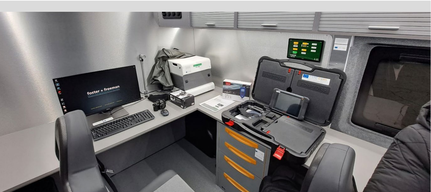
'Schengen Bus' (vehicle equipped with specialized VSC-80i equipment for document examination)

To enhance the technical capacities of the Moldovan Border Police in crime prevention and their preparedness to respond to border incidents involving the fraudulent use of travel documents —based on EU standards and the Schengen acquis — the action facilitated the purchase of a mobile forensic laboratory, a vehicle equipped with specialized VSC-80i equipment for document examination (known as 'Schengen Bus') for the Border Police of the Republic of Moldova. Practical training sessions on the use and maintenance of this equipment were also organised for the benefit of the Moldovan counterparts.